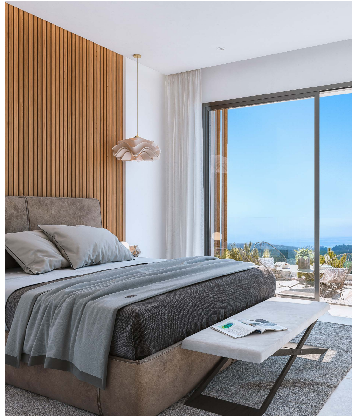
Non-contractual, non-binding advertising image.