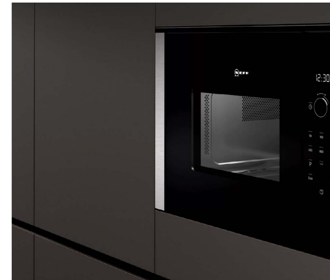
Non-contractual, non-binding advertising image.