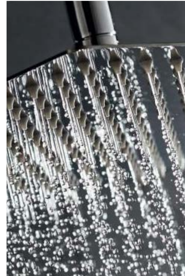
Non-contractual, non-binding advertising image.