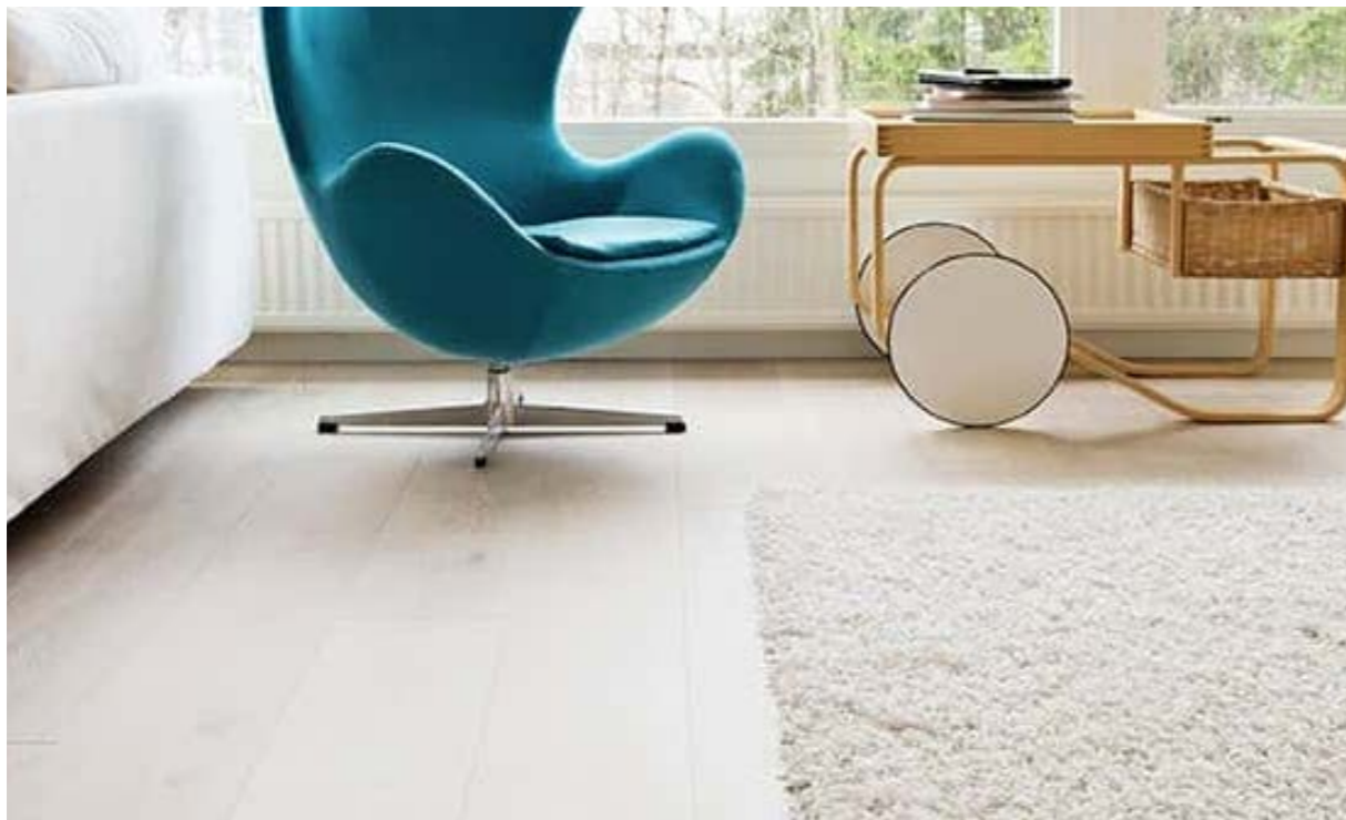
Non-contractual, non-binding advertising image.

“The overall look of the Vintage grade is stunning, rugged and rustic.”