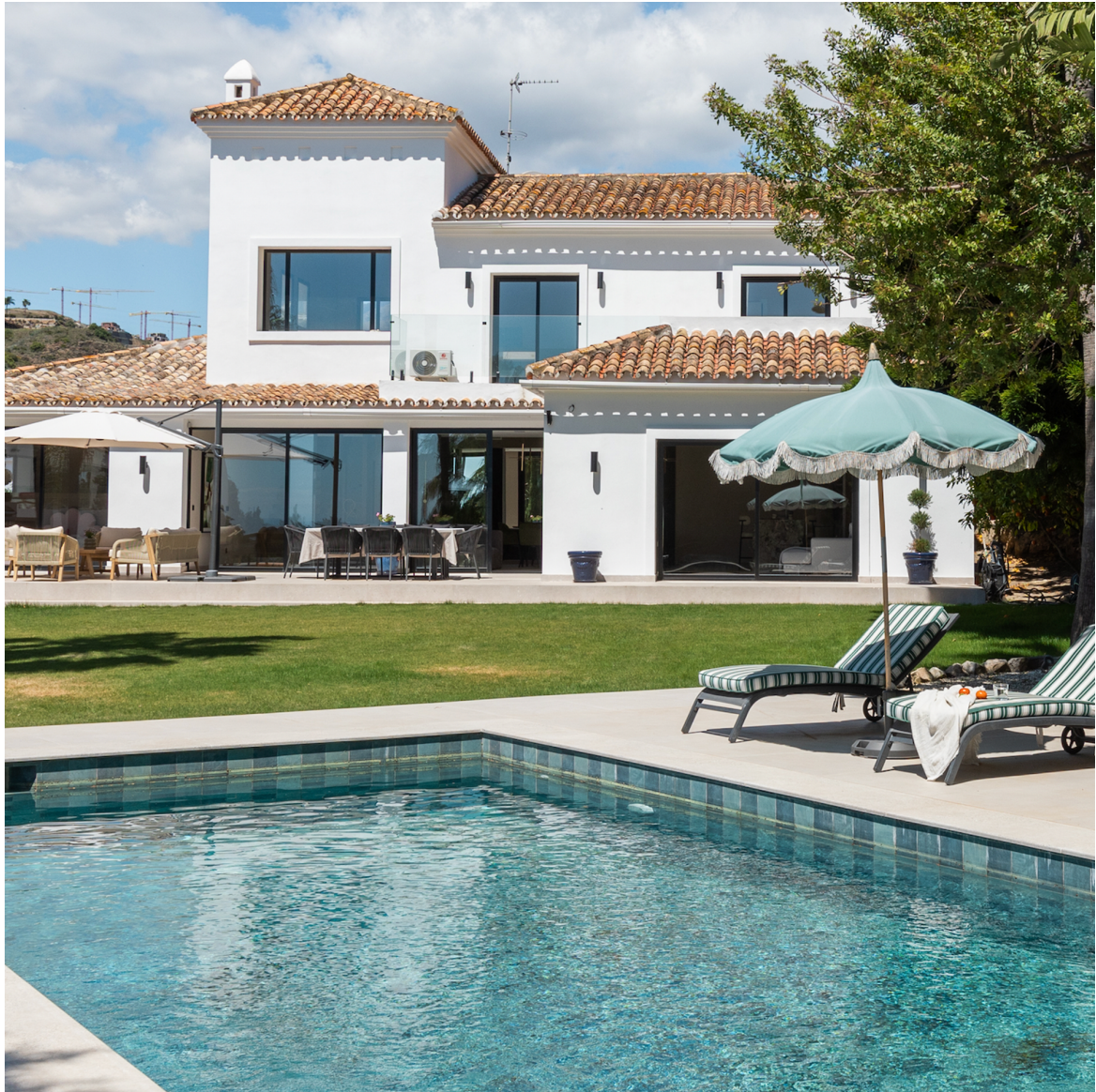
Property in Benahavis