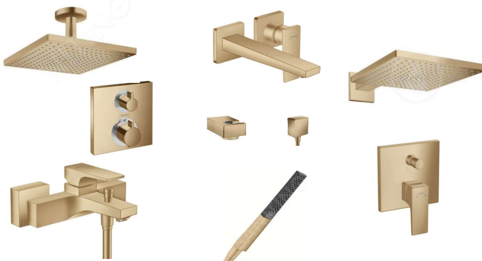
Master Bathroom Taps

Backlit mirrors Fanti-slip floor integrated shower tray. Full size sliding shower screen. Wall mounted toilet, concealed in wall tank, dual-flush actuator medium and complete discharge. Soft close toilet seat.