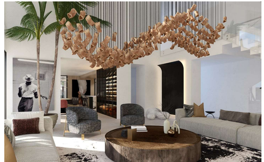
Non-binding figurative image

The client has the option of hiring an interior designer of recognized prestige in Marbella, specialized in residential projects. Its versatility and innate style will give each space of the villa a unique touch. It is accompanied by the present report of qualities proposed for interior design, which is reflected in the interior images of this villa.