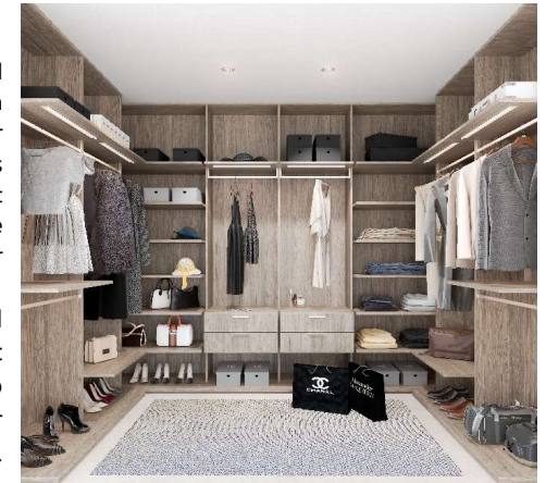
Non-binding figurative image

The distribution, fittings, taps and bathroom furniture has been chosen out with the support of interior designer, so that it is not just a sum of pieces or elements, but a space thought as a whole.