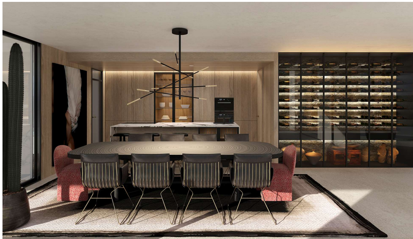
Non-binding figurative image

Wine cellar that can be seen in the images isn't included, is just for figurative and decoration purposes, as well as the rest of furniture shown on the pictures.