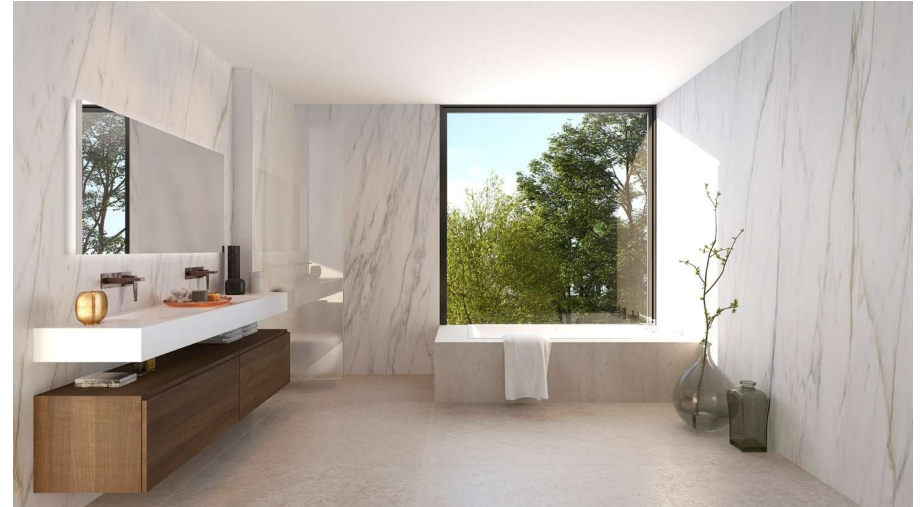
Non-binding figurative image