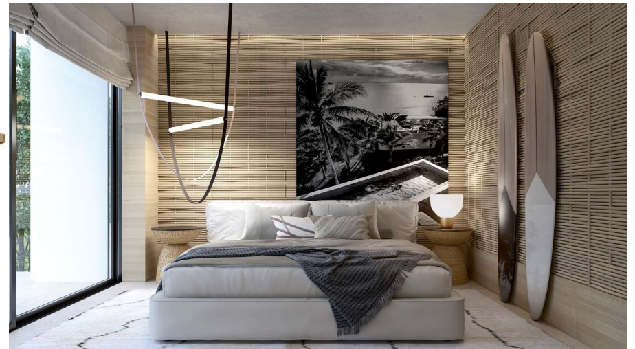
Non-binding figurative image