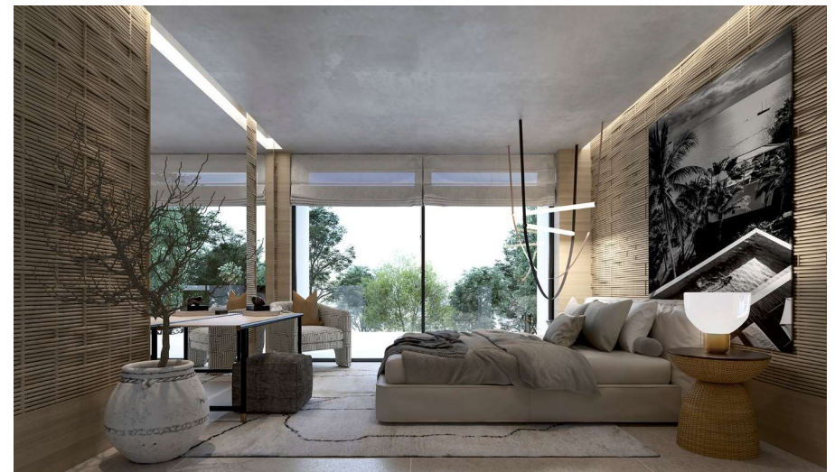
Non-binding figurative image