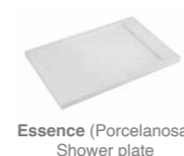
Essence (Porcelanosa) Shower plate