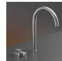
Plumb GIO21 (CEA)