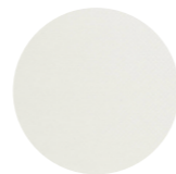
Zelda White M26/110217 (Newker) Bathroom 1 and Master Bathroom. All walls except the shower feature wall.