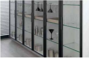
R4.70 Blanco Sal (Porcelanosa) Gallery for kitchen