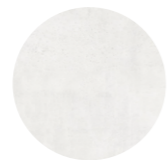
Metropolitan Caliza (Porcelanosa) 80 x 80. Ceramic Tile for exterior, interior flooring, and pool tiling.