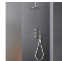
Shower hose (CEA) MIL90