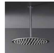
Rain shower head (CEA) FRE40