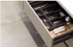
Etimoe Ice – Gris Hook Mate (Porcelanosa) Kitchen design