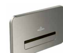
Installation system (Porcelanosa) Stainless Steel