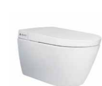
I-Comfort (Porcelanosa) WC