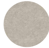
Museum grey 30x90 (Newker) Guest bathroom 1 and 2. All walls except shower wall.