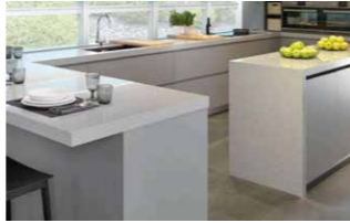
WIND MATE – EUCALYPTUS (Porcelanosa) Option for island (Silestone White)