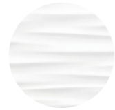
Maui ivory m28/165201 (Newker) Shower feature wall.