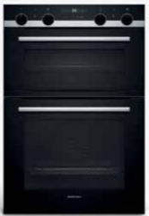
iQ500 Built-in double Stainless-steel oven