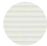
Museum Decor white 30x90 (Newker) Feature shower wall guest bathroom 1 and 2.