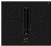
iQ300 Induction hob with integrated ventilation system 80 cm