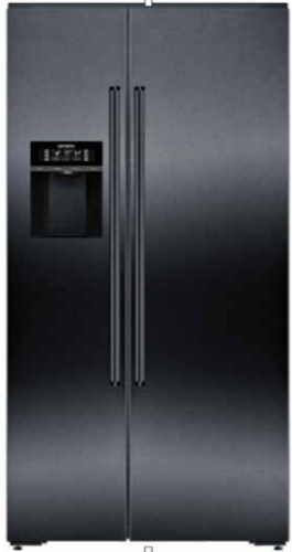
Fridge - iQ700 American fridge 177.8 x 91.2 cm Black stainless Steel